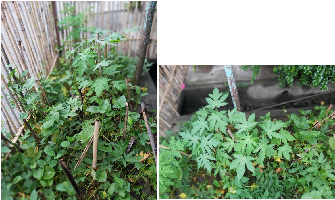
Figure 2. Planted moringa and papaya