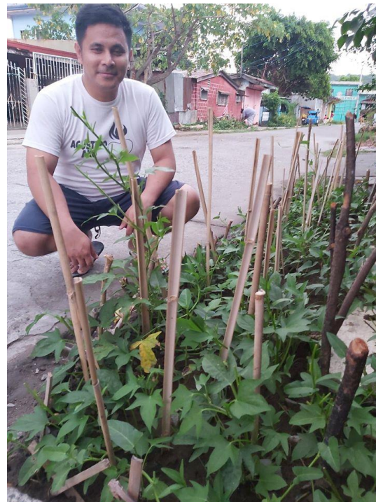
Figure 1. Planted sweet potatoes

maintain a high biomass throughout the growing cycle was crucial for ingrained yield, while a stay-green pattern was important for hybrid yield. While new reckonable phenotyping tools such as spectral reflectance allowed for the characterization of growth and senescence patterns as well as yield, qualitative measurements of canopy senescence were also found to be associated with grain yield (Cairns, Sanchez, Vargas, Ordoñez, & Araus, 2012).